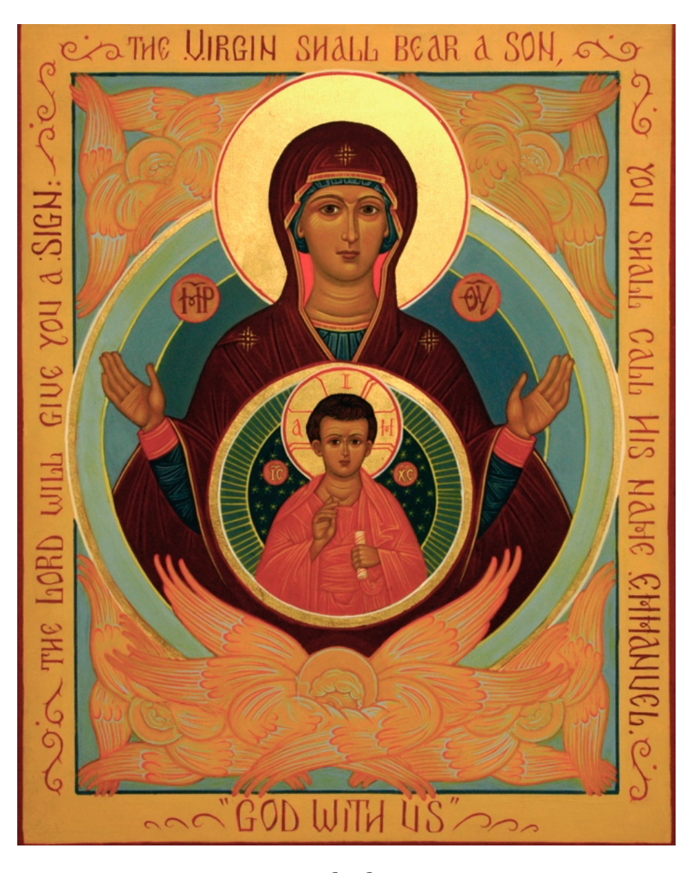
Icon of the Sign

You are a tower adorned with gold, a city surrounded by twelve walls, a shining throne touched by the sun, a royal seat for the King, O unexplainable wonder, how do you nurse the Master?